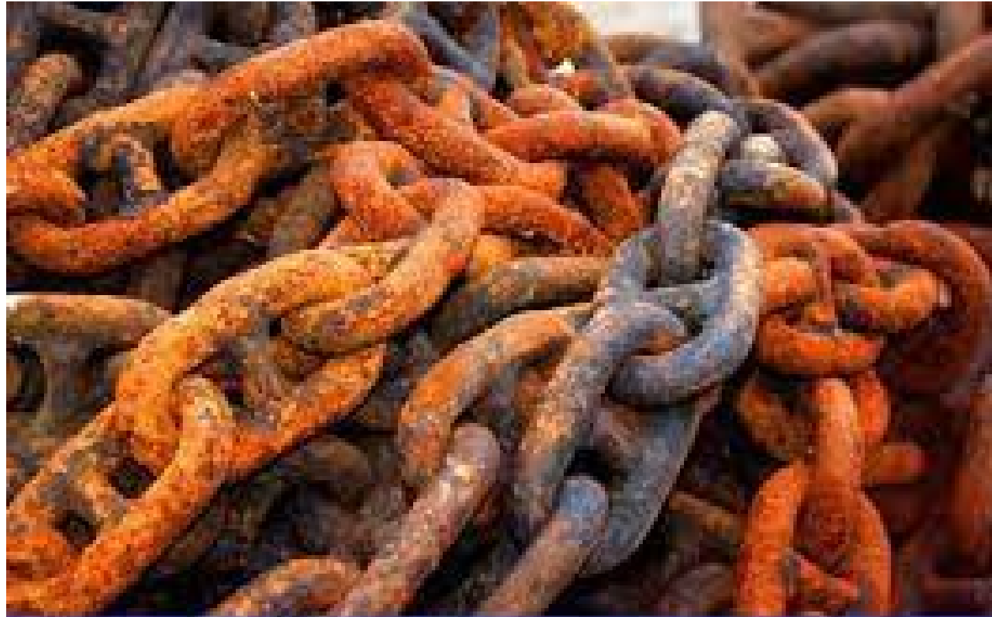
Rusting in iron chains